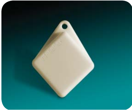
The Intellex FBT-7400 fob tag provides long range in a highly compact form factor.

Long range, highly compact RFID tag with flexible attachment options for asset tracking.